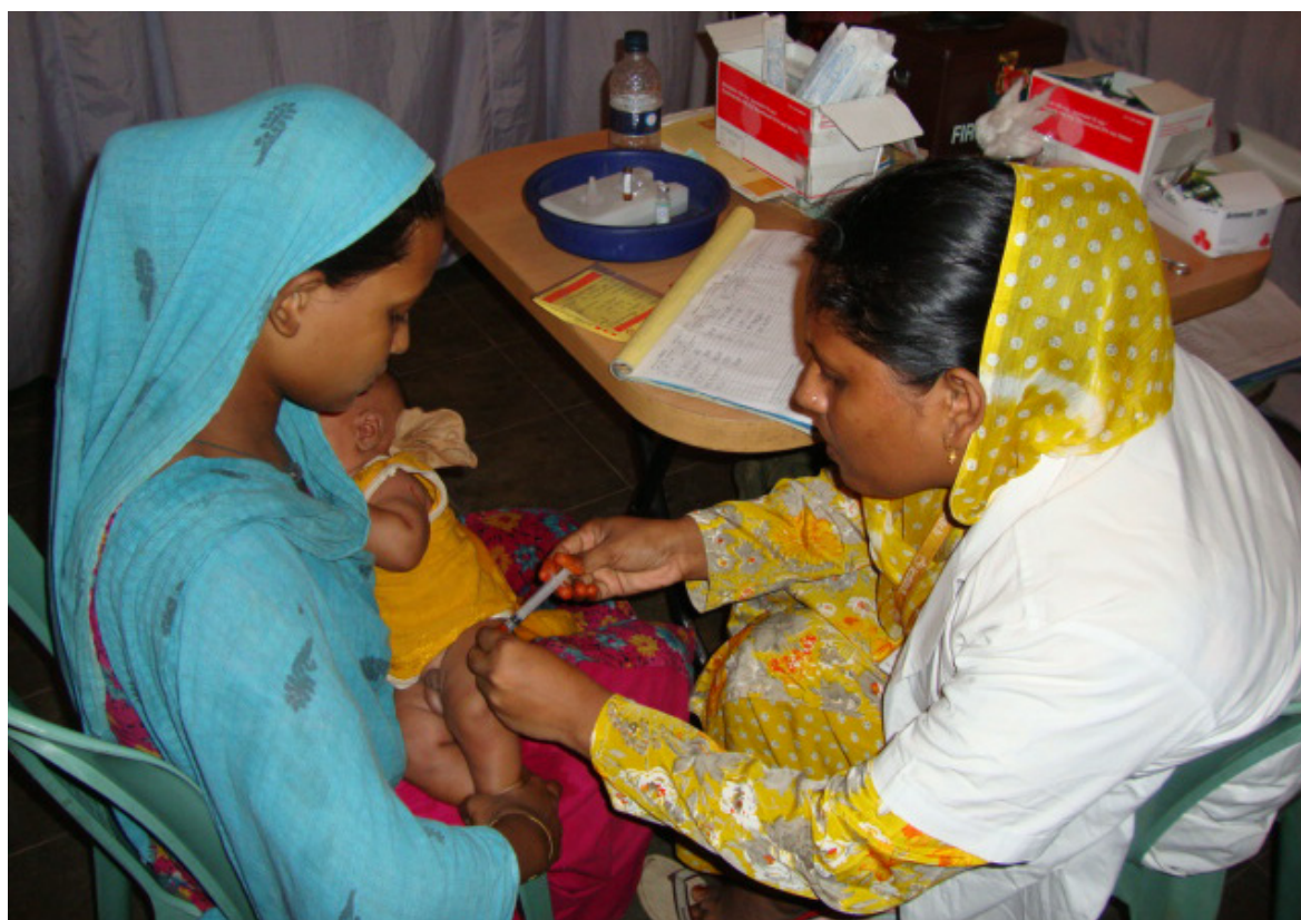
Table 27. Antigen-wise reported child immunization coverage