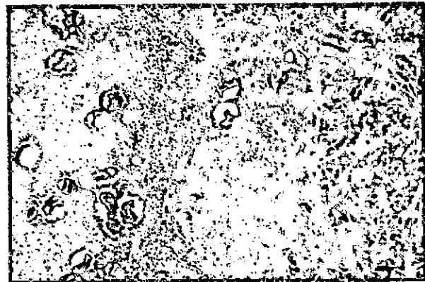
Fig. 4. Ova of A. lumbricoides in inflammatory exudate in the wall of destroyed hepatic ducts. H & E stain; magnification 33 X.