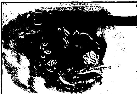
Fig. 2. Coils of multiple A. lumbricoides within liver abscess.

On microscopic examination the liver tissue adjoining the abscess cavities revealed destruction of the hepatic ducts by inflammatory exudate and granulation tissue, in which numerous ova of Ascaris lumbricoides were present. Adjoining liver parenchyma showed biliary stasis and sinusoidal