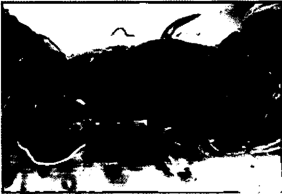
Fig. 1. Adult Ascaris lumbricoides protruding through ruptured liver abscess showing distended and destroyed hepatic ducts.

the small intestine appeared oedematous, mucosa of transverse colon and rectosigmoid showed dark reddish brown discolouration. Eight Ascaris worms were found in the small intestine. No perforations were found in the intestinal tract. The liver showed 10 subcapsular abscesses, the largest of which was 2 cm in diameter. One abscess in the liver was found ruptured, through which 3 Ascaris worms protruded into the peritoneal cavity. The main bile duct and the major branches of hepatic ducts were filled with many coiled up Ascaris . Upper lobe of right lung was collapsed, its lower lobe appeared congested but did not show definite consolidation. Upper lobe of the left lung appeared unremarkable but lower lobe of left lung showed small patches of consolidation. Heart, kidney spleen and adrenals appeared unremarkable.